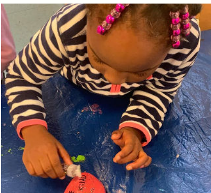
Julie's Family Learning Program