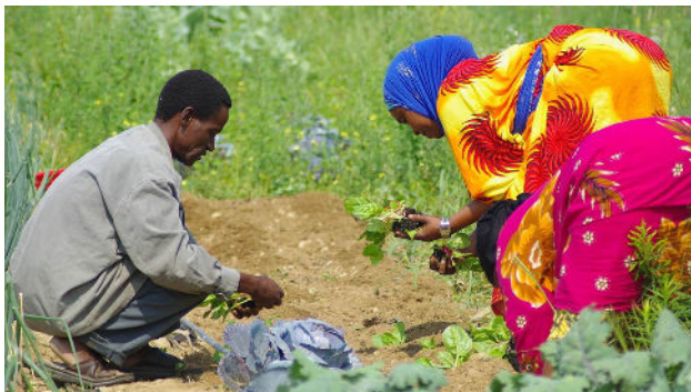
Somali Bantu Community Association