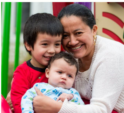
Family & Children's Service of Greater Lynn, Inc.