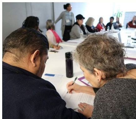
The Lenny Zakim Fund