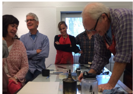
Participants engage in Agassiz Baldwin Community's Maud Morgan Arts programming.

Photographs courtesy of Agassiz Baldwin Community.