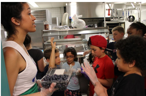
Agassiz Baldwin Community members prepare a nutritious treat.