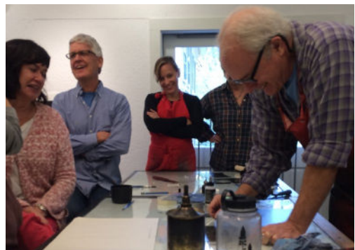
Participants engage in Agassiz Baldwin Community's Maud Morgan Arts programming.