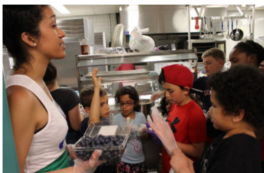
Agassiz Baldwin Community members prepare a nutritious treat.

Human Resources Consultant Horizons for Homeless Children