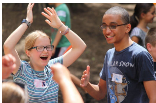
Attendees enjoy an Agassiz Baldwin Community event.