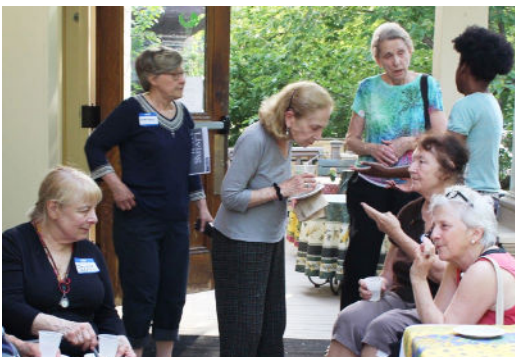
Agassiz Baldwin Community members converse at a summertime gathering.